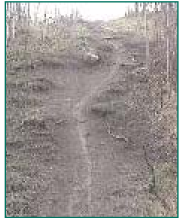
Repeated descents on steep terrain cause erosion.